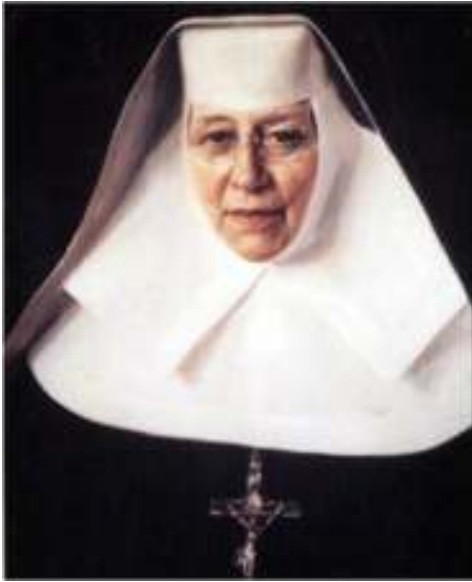
St. Katharine Drexel