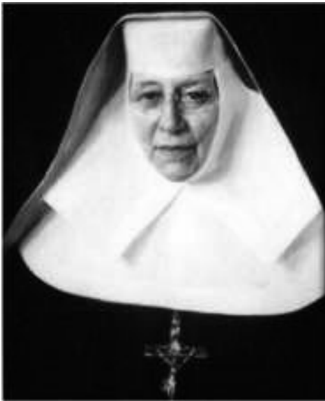
St. Katharine Drexel