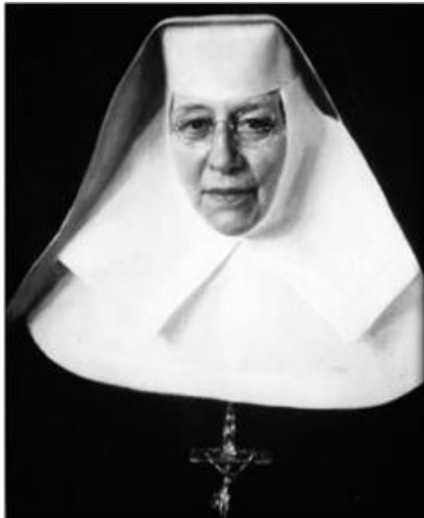
St. Katharine Drexel