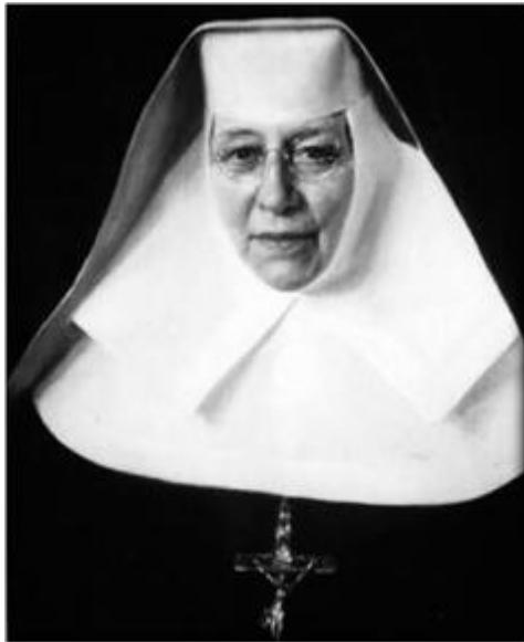
St. Katharine Drexel