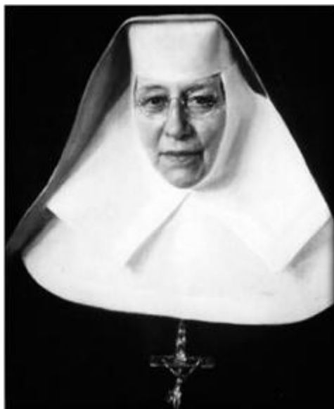
St. Katharine Drexel