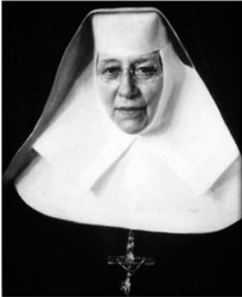
St. Katharine Drexel