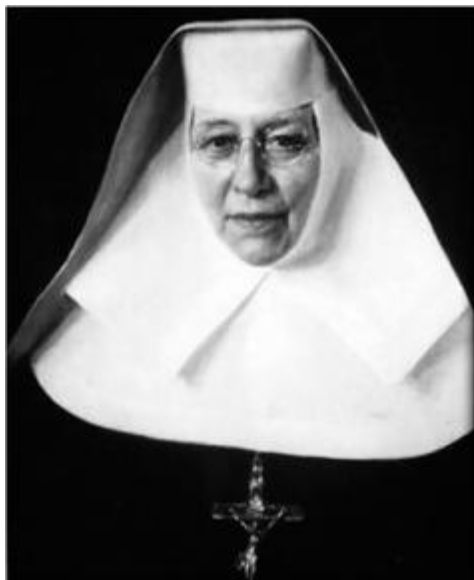
St. Katharine Drexel