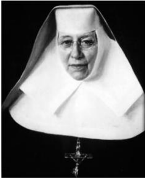
St. Katharine Drexel