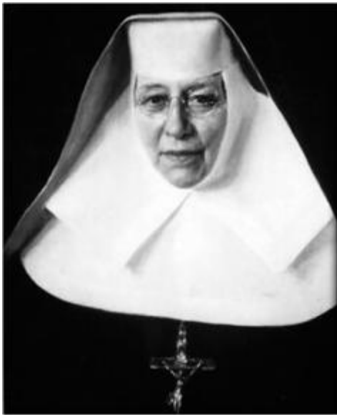
St. Katharine Drexel