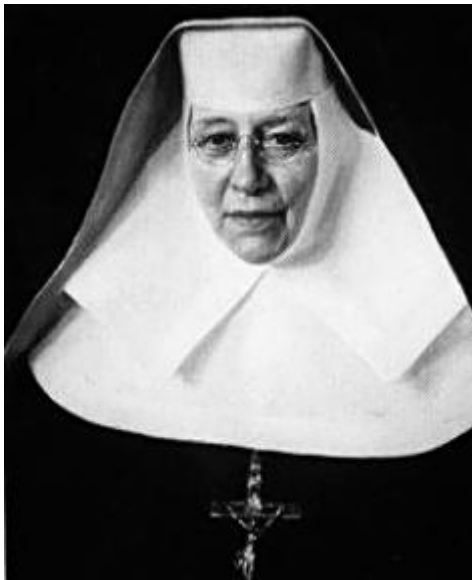
St. Katharine Drexel