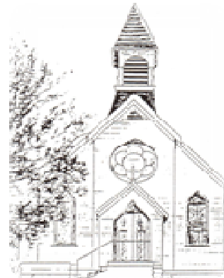
St Joseph's Shrine of Katharine Drexel