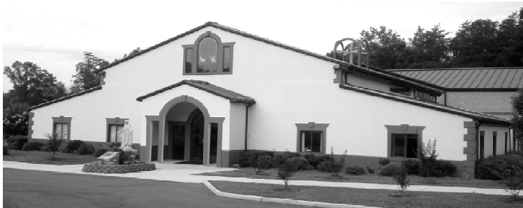
Sts Peter and Paul

Office: (434)589-5201 * FAX: (434)589-4463